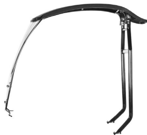
ROOF & WINDSHIELD