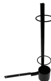
WALKING STICK HOLDER